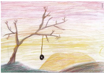
Cassidy Parke (Year 5)