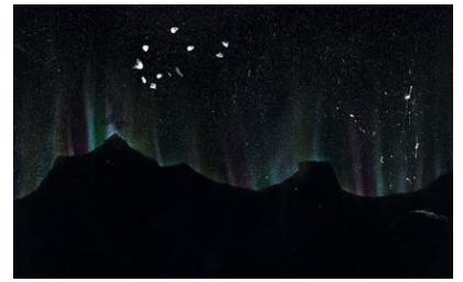
Oliver Hurrell (Year 5)