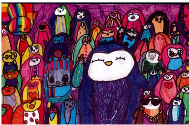
Neve 'Aho (Year 3)