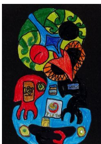
Bede Healey (Year 5)